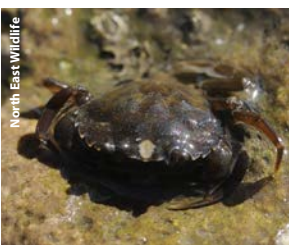
North East Wildlife

Hayburn Wyke’s mixed woodland is visited by roe deer, fox and badger. Over 30 species of breeding birds have been recorded, and in spring and summer you may well catch a glimpse of redstart, blackcap and spotted flycatcher. Great spotted woodpecker and green woodpecker are resident throughout the year.